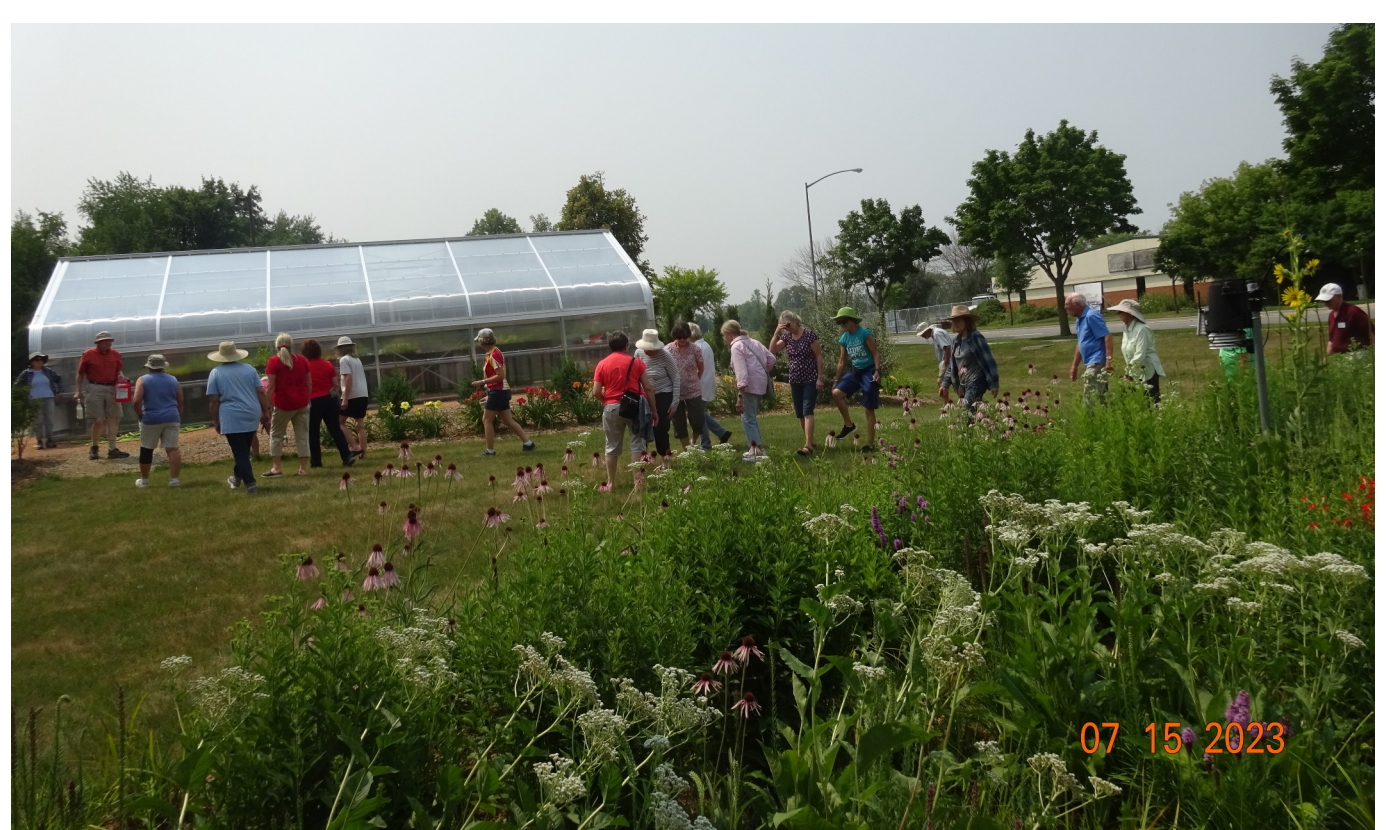
MAMGA members head for lunch and air conditioned space after touring the Teaching Garden. The new greenhouse is in the background. MAMGA volunteers have transformed this corner of the property into several demonstration gardens. Despite the hot weather, we had a good turnout. The site is open to the public and contains some very interesting perennials.

Photos of Garden Tour Sites This month's photos on the cover and page 5 were taken in a beautiful garden on the joint MAMGA/WHPS (WI Hardy Plant Society) Garden Tour held on July 18<sup>th</sup>. The garden owner estimated that she spends about 20 hours a week growing and tending to her yard starting in winter months. Most of the annuals are grown from seed; others are propagated by cuttings and kept all winter under grow lights. The results are amazing. The yard is set on a hillside next to Old Sauk Road with several tall evergreens providing a backdrop for the floral riot of color that pours down to the street level. The photo on page 5 shows the concrete stepping stones that the owners poured and rolled into place to create an inviting walkway through the flower beds. It was a joy to walk through this garden with other smiling gardeners.