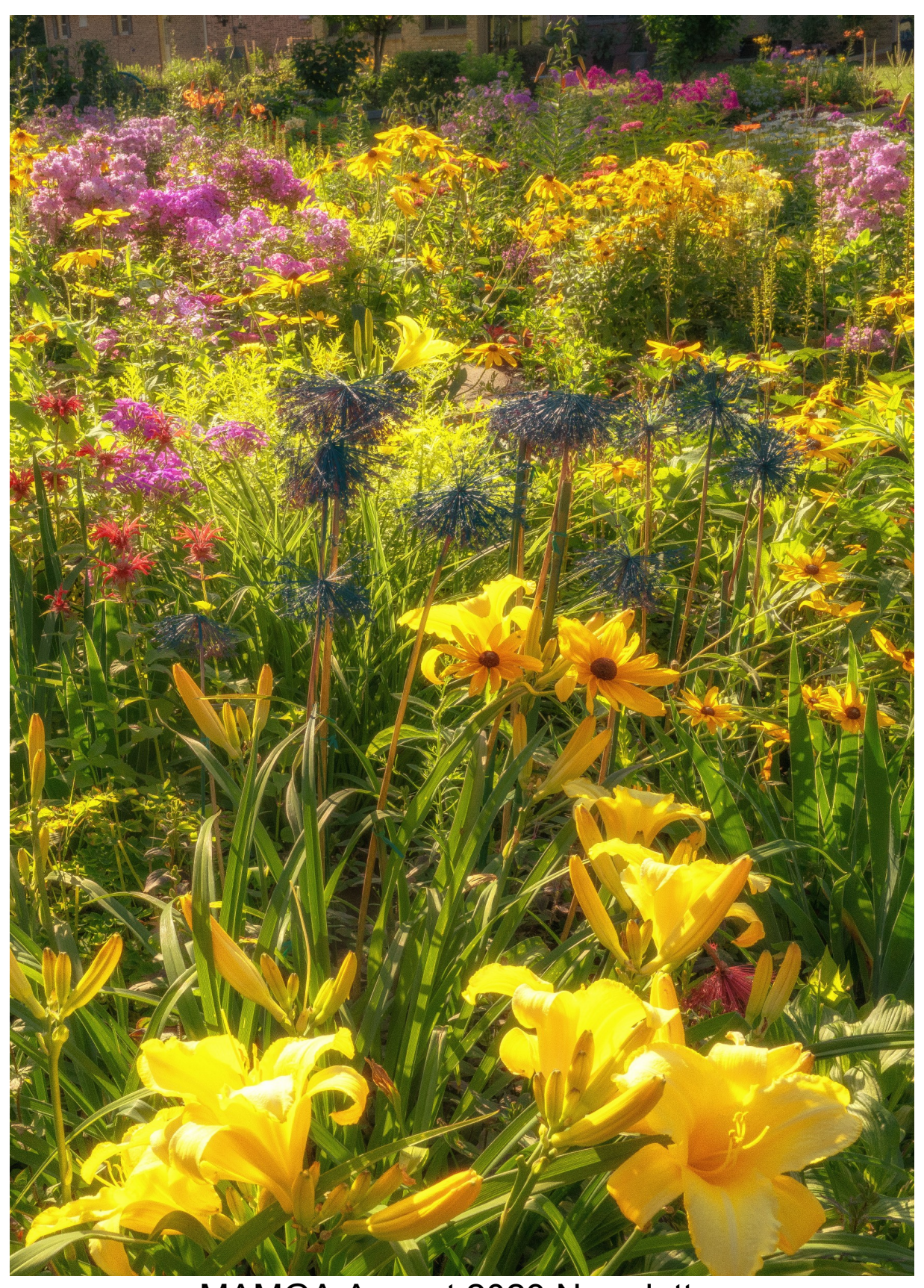
MAMGA August 2023 Newsletter