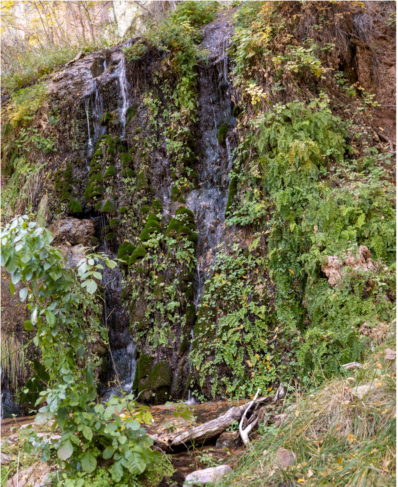
Hanging Garden in Zion National Park