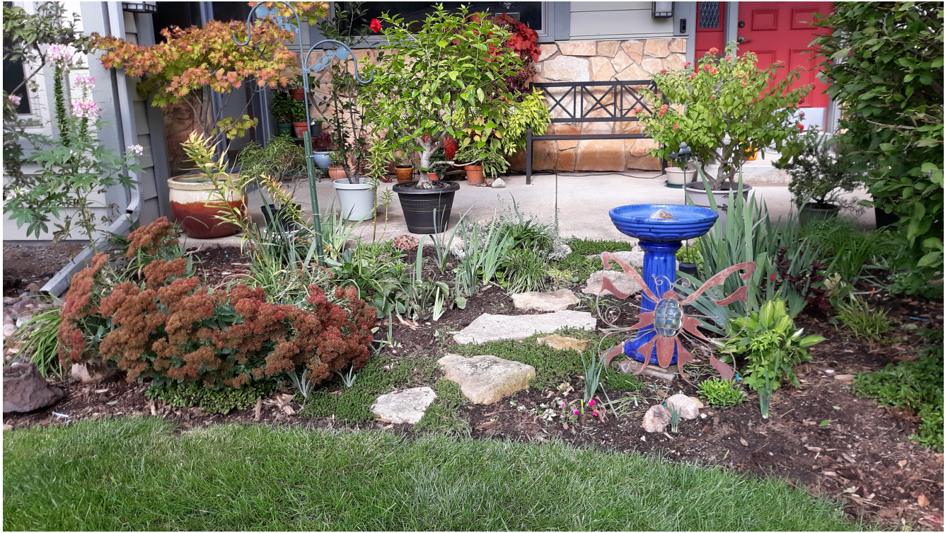
Two border gardens