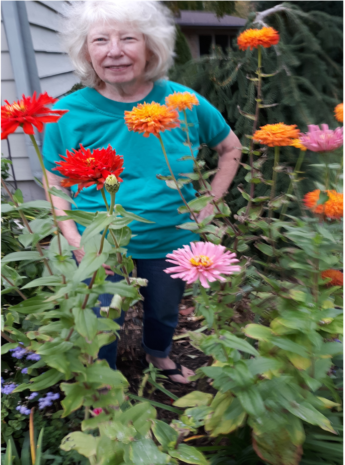
The Gardener in her element