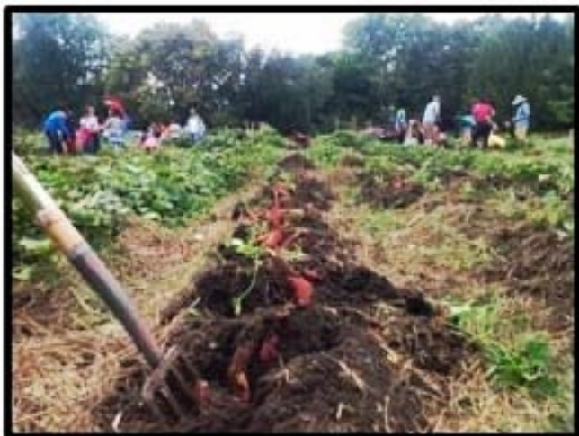
2013 Harvest at the Youth Grow Local Farm