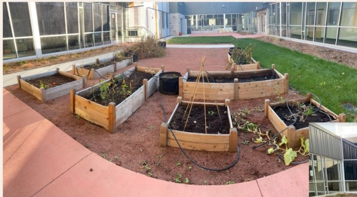
(Current garden set up)

Pictured below are photos of the garden that requires assistance. AmeriCorps Farm-to-School Specialists are planning to reposition garden beds as shown in the diagram below.